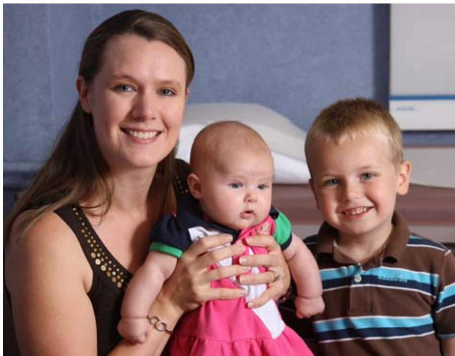
Picking up her baby, pain-free, just a couple weeks after a lumbar discectomy.